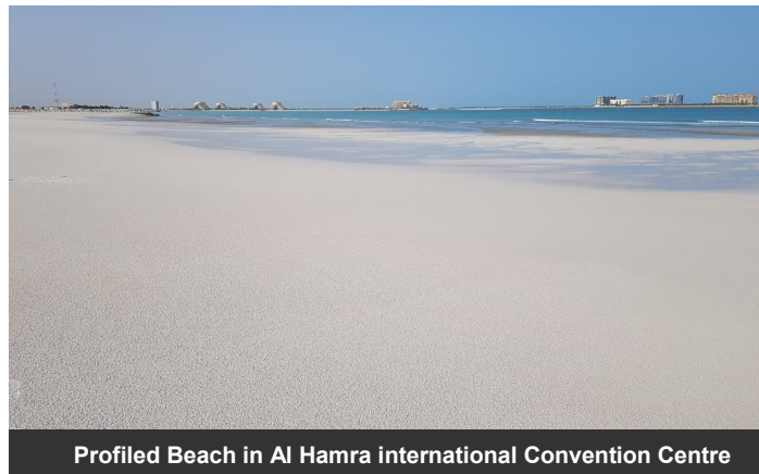
Profiled Beach in Al Hamra international Convention Centre

Stevin Rock's customers' satisfaction is of paramount importance and the Company is committed to maintain the highest level for the quality of its products and services, recognized by the Company's ISO 9001 certification through the use of state-of-the-art equipment supervised by highly qualified and experienced management together with stringent quality assurance procedures.